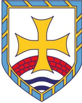
CHANTRY MIDDLE SCHOOL