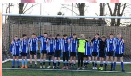
Year 9 Boys football County Cup