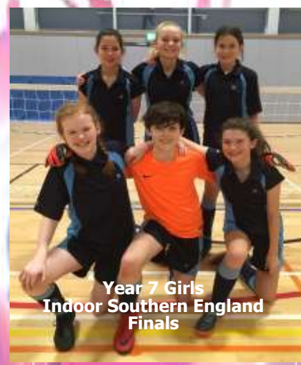
Year 7 Girls Indoor Southern England Finals