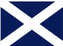
Year 2 Scotland