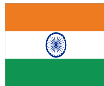
Year 6 India