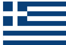
Year 5 Greece