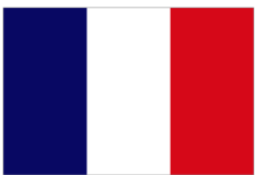
Year 3 France

We look forward to reporting on this themed week in the next edition of the newsletter.